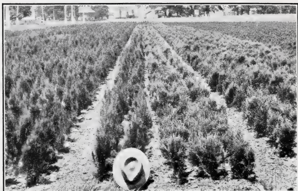
Thuja and "Biota" Elegantissima, grafts.